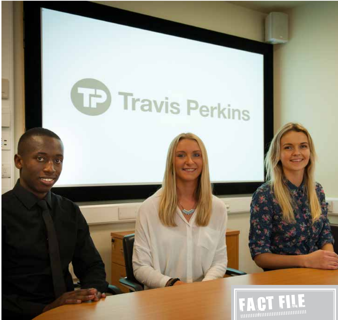
Three young students who are looking forward to a rewarding career in logistics thanks to Travis Perkins and NOVUS

network around the company and guiding me on assignments. He always puts me in contact with people if he can't help me directly with my questions. I really feel that Travis Perkins recognises that we are the future."