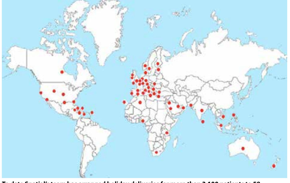
To date Spatial's team has arranged holiday deliveries for more than 3,100 patients to 58 countries on four continents (so far no-one has holidayed in Antarctica)

"Overall, it's a job that's impossible not to enjoy. It gives us a real sense of satisfaction, and we are incredibly proud of our achievements."